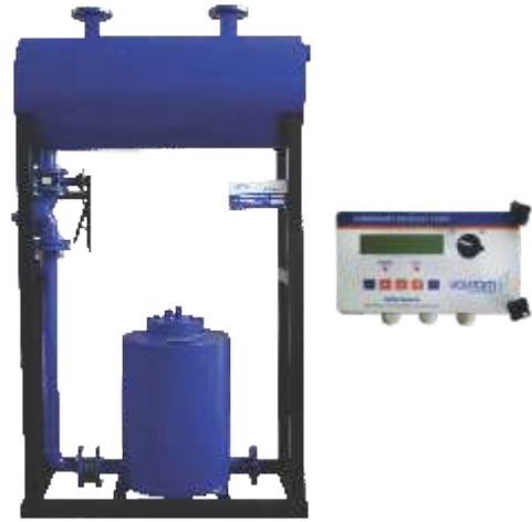
Condensate Recovery System