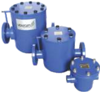
Rotating Plug Float Trap